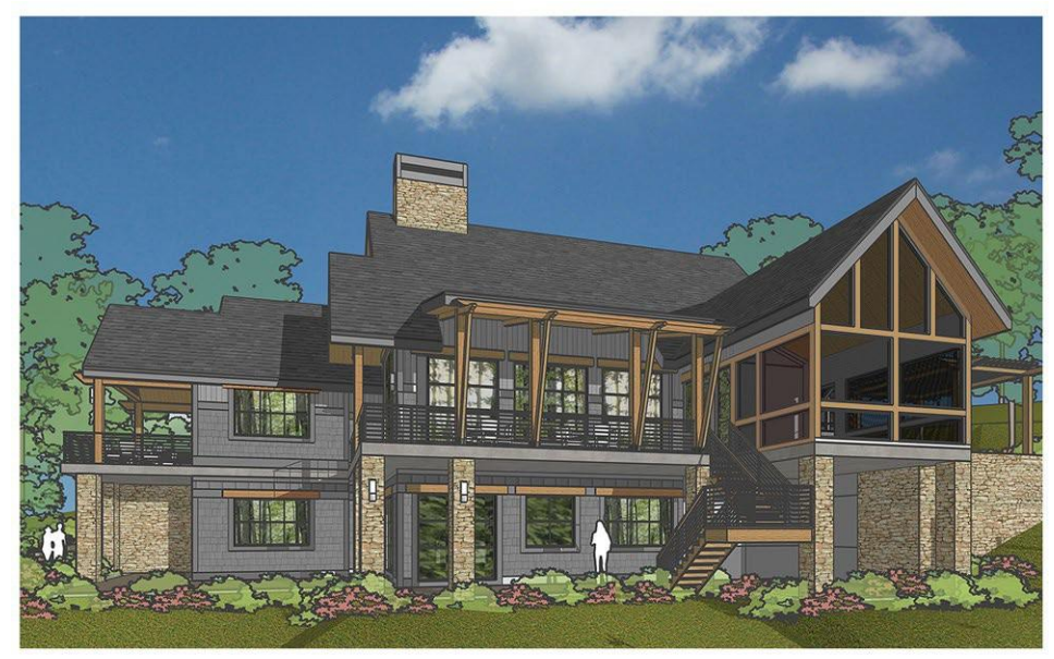
EXAMPLE 1, COLOR SKETCH PERSPECTIVE (ILLUSTRATING OVERALL BUILDING MASSING, MATERIALS, TEXTURE, COLOR PALETTE, CONCEPT LANDSCAPE)

Prior to the preparation and submission of full construction drawings for review and approval, the CHARC requires that the Owner's architect or design professional submit a PRELIMINARY PLAN along with exterior sketches, using CAD or freehand, to illustrate the overall design. A minimum of two (2) sketches is required: the front view from the street and a rear view. The sketches should show the building massing, materials, finishes, fenestrations, color palette and any special design feature the architect or design professional wishes to highlight. See examples: