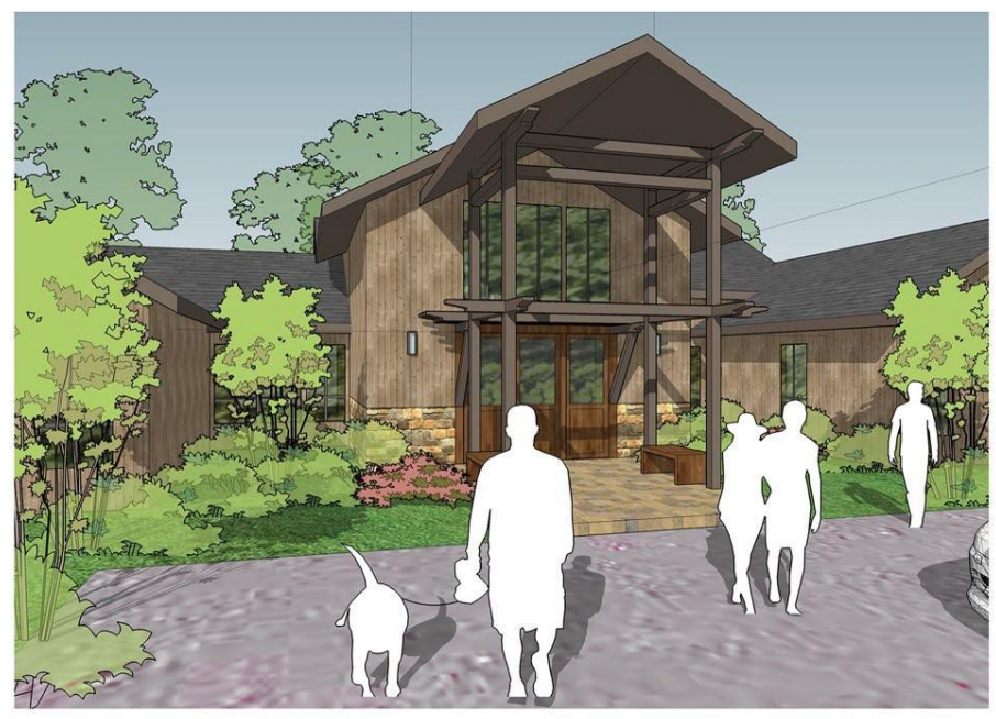
EXAMPLE 2 - COLOR SKETCH PERSPECTIVE (ILLUSTRATING OVERALL BUILDING MASSING, MATERIALS, TEXTURE, COLOR PALETTE, CONCEPT LANDSCAPE)